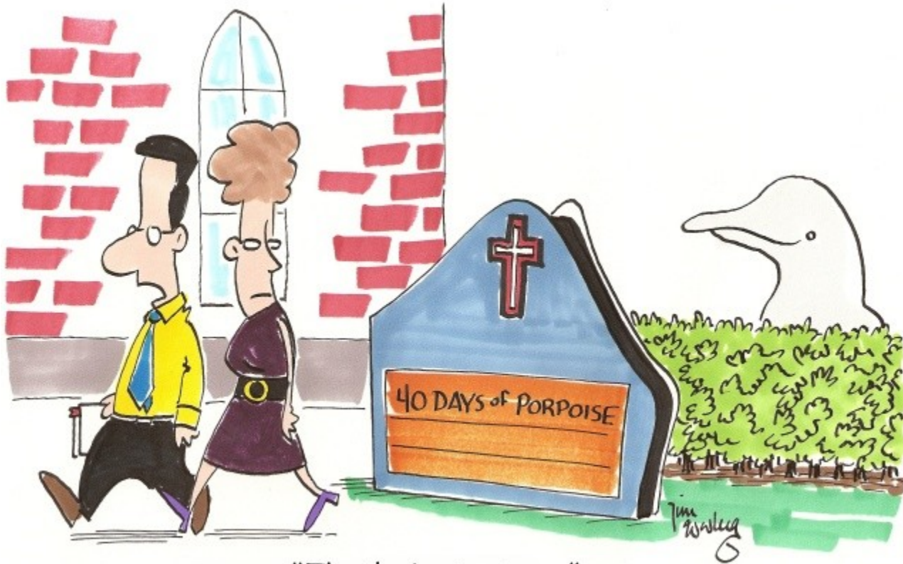
"That's just a typo."

Weekly Rates: (Except GFS Junior Weeks) - Five or more consecutive days 10% discount off "Daily Rates" listed above per person. Does not apply for Special rates. Children 10 and under are half price based on rates listed