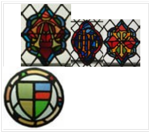
The central features of the rear windows, and shield from one of the side windows.